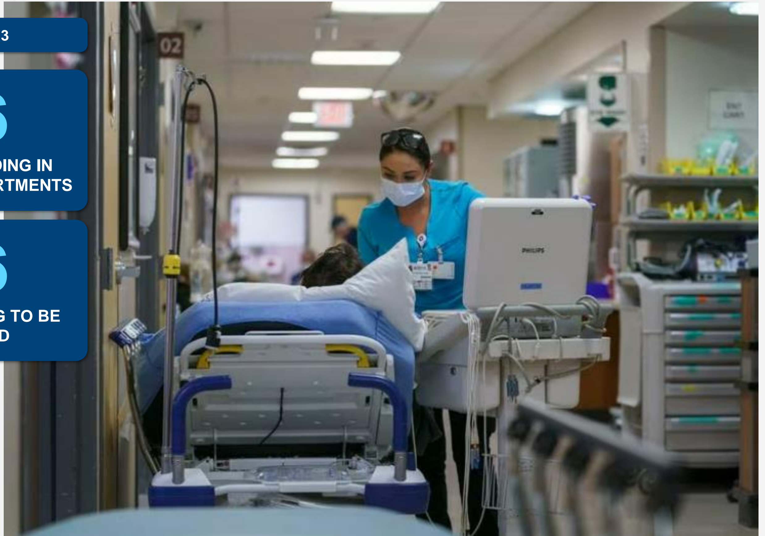
SALEM HEALTH EMERGENCY DEPARTMENT