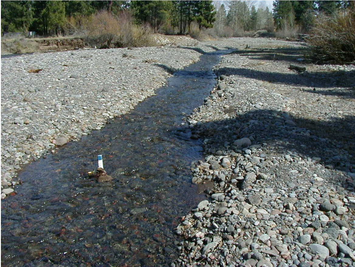
Whychus Creek Pre-Restoration