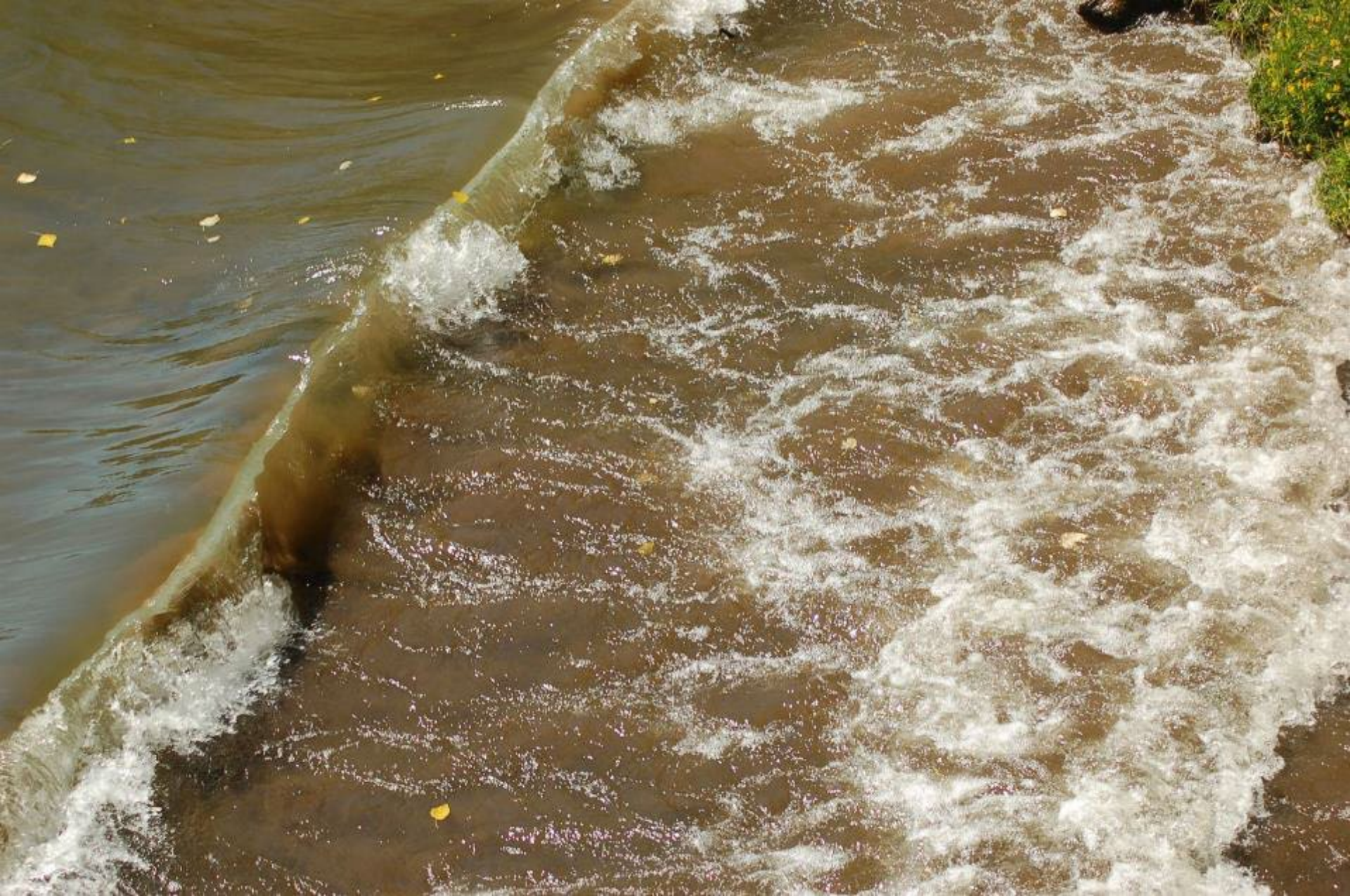
Wave on shoreline of Willamette River after wake boat passed