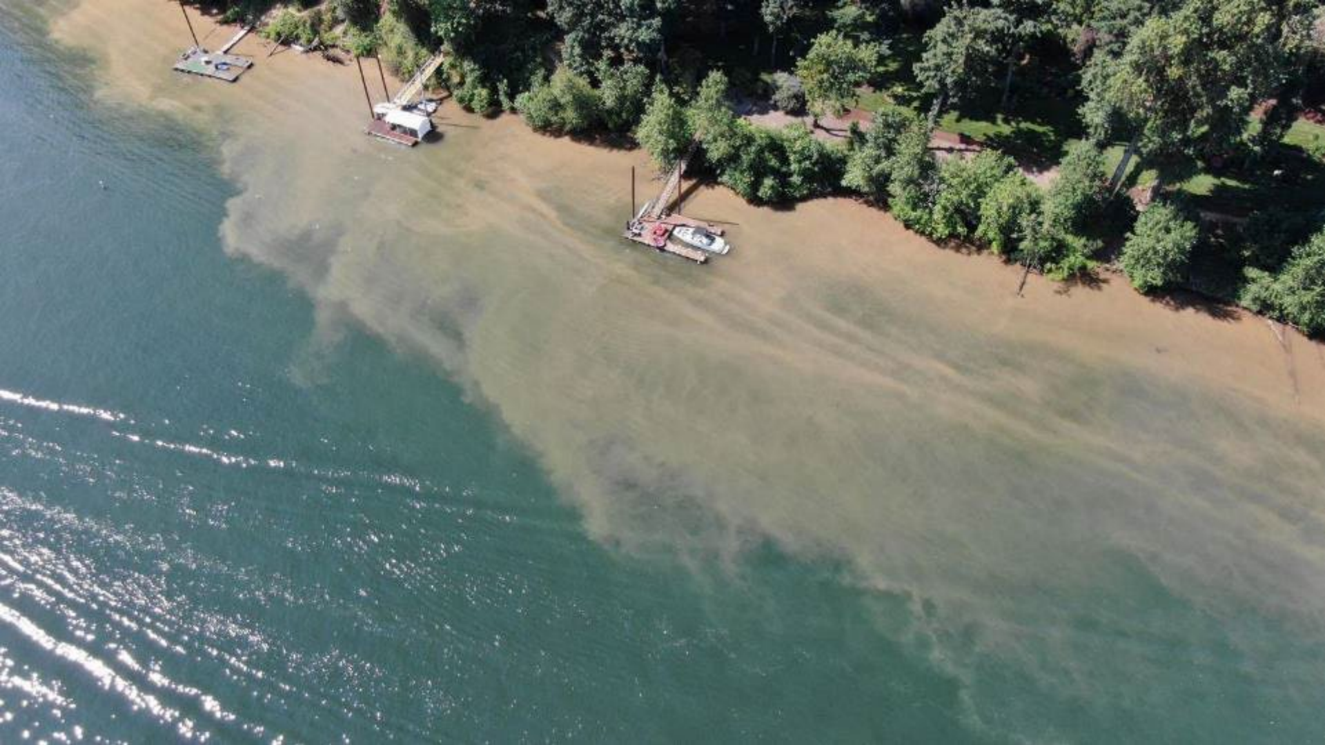
Shoreline of Willamette River after wake boat passed