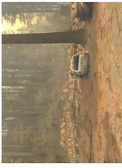
Holiday Farm Fire 2020

With GCAP's assistance, many of our clients successfully contacted the large primes that had been awarded the various debris removal contracts. The assistance included identifying the prime contractors for the different regions, helping them create informative Capability Statements, and understanding how to interact with primes. We had several successful and thankful clients, and at least one even reported that, instead of a subcontract, they were offered a good job.