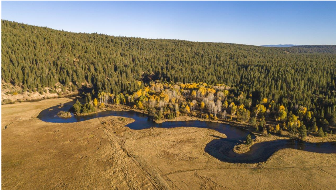
Jackson Kimball State Park (drone image)