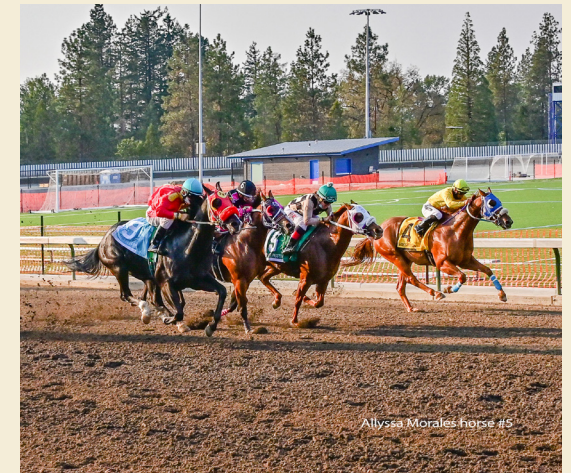
Allyssa Morales horse #5

The statute says these private organizations are allowed to use these supplemental funds for “operating expenses and other benefits for horsemen” in the state. Grants Pass Downs is committed to keeping horse racing alive in the