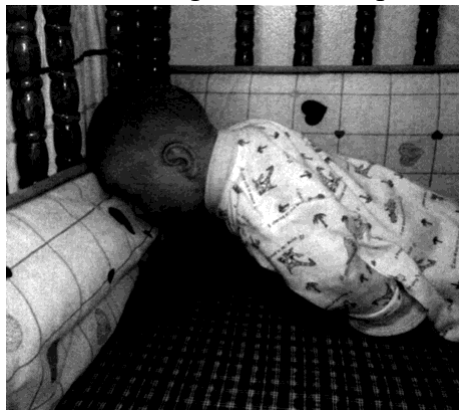
Figure 1: Death scene reconstruction with a mannequin. 15