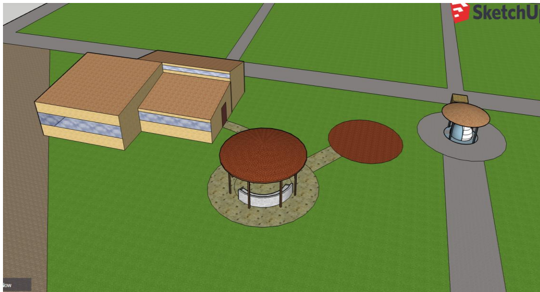
Ceremonial and educational center Conventional/traditional kitchen

NOTE -If the preferred funding is set aside ($160 million total ) we will pursue the acquisition of approximately 50 acres of land (in rural HD 22). The additional land space (25-35 acres) we will use to build affordable housing rental units and affordable single housing or Cooperative Mobile Park. The housing component of the Anahuac project would be led by FHDC. We are using the following formula to determine the average per acre development costs = \$3M \times 10/30 \text{ acres} = \$30M / \$90M based on FHDC's prior development experience.