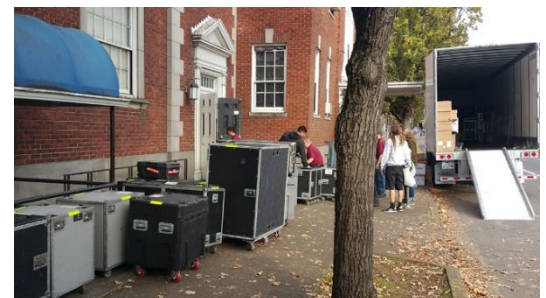
(top) Main entrance to Ticket & Registrar offices; (below) Stage Door, load-in, entrance