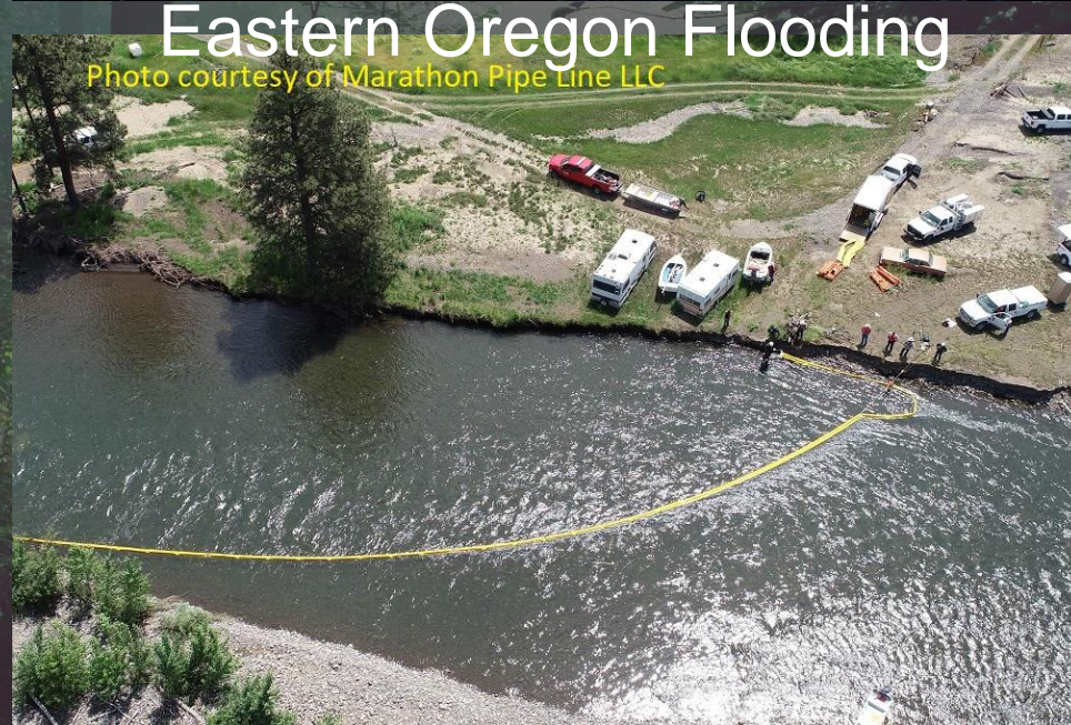
Eastern Oregon Flooding