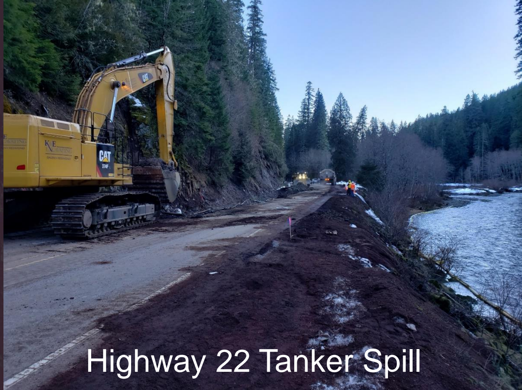
Highway 22 Tanker Spill