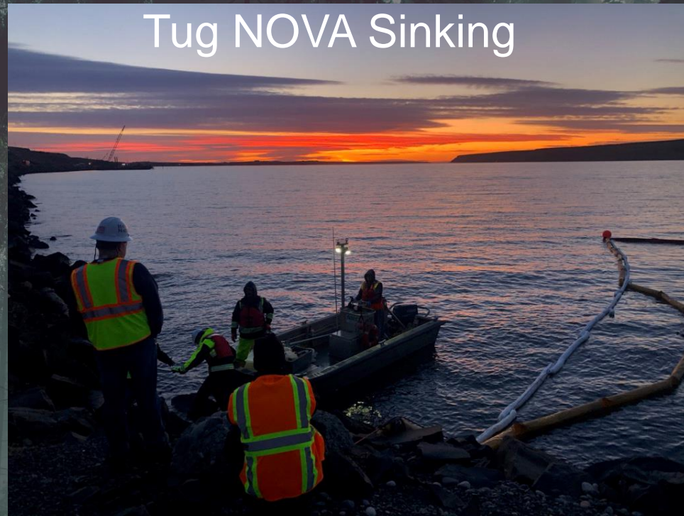
Tug NOVA Sinking