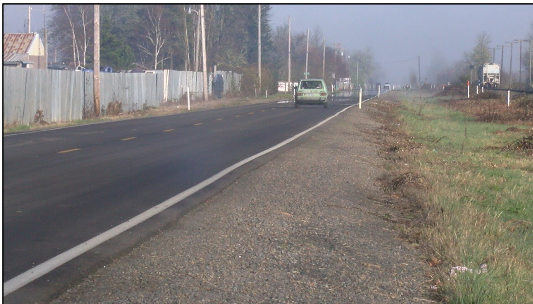
Highway 99 between Cottage Grove and Creswell (KEZI)

Here is a daytime photo of this section of highway: