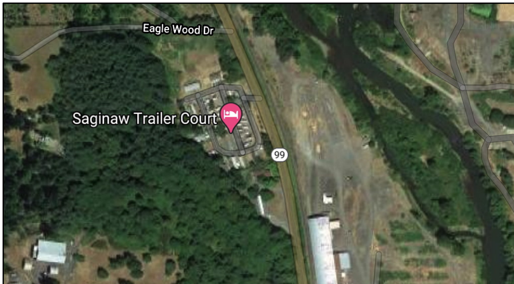
Saginaw Trail Court on Highway 99

Here is a daytime photo of this section of highway: