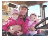
Hope for the future