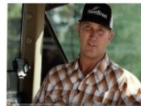
Amsted Produce on