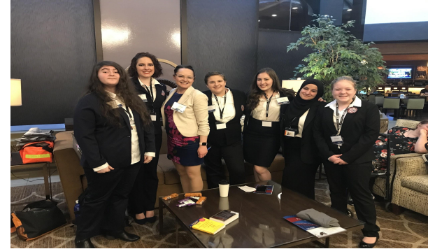
2019-20 HOSA Team: State Competition