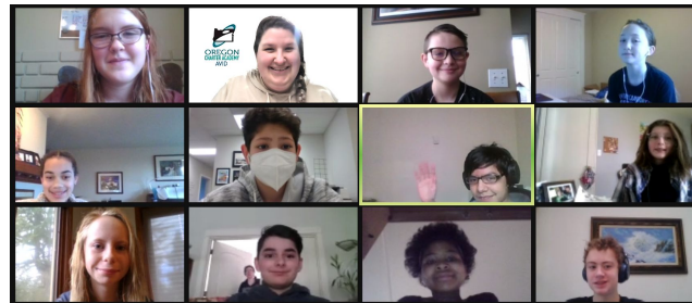
AVID Class Collaboration Session

The mission of Oregon Charter Academy is to prepare all students for success in a global society through an inclusive, rigorous, academic environment where students have daily live interaction with highly qualified teachers and continuous access to curriculum. Oregon Charter Academy staff partners with families in a transparent, collaborative school environment to support all students in their academic journey.