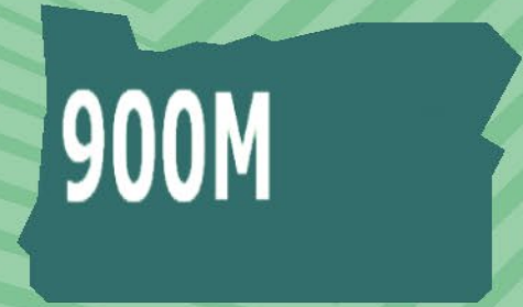
Student Share of the Cost of Education At Oregon Public Universities