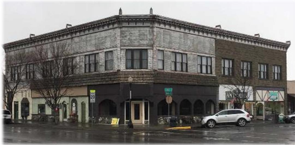
Enterprise: façade, housing, retail