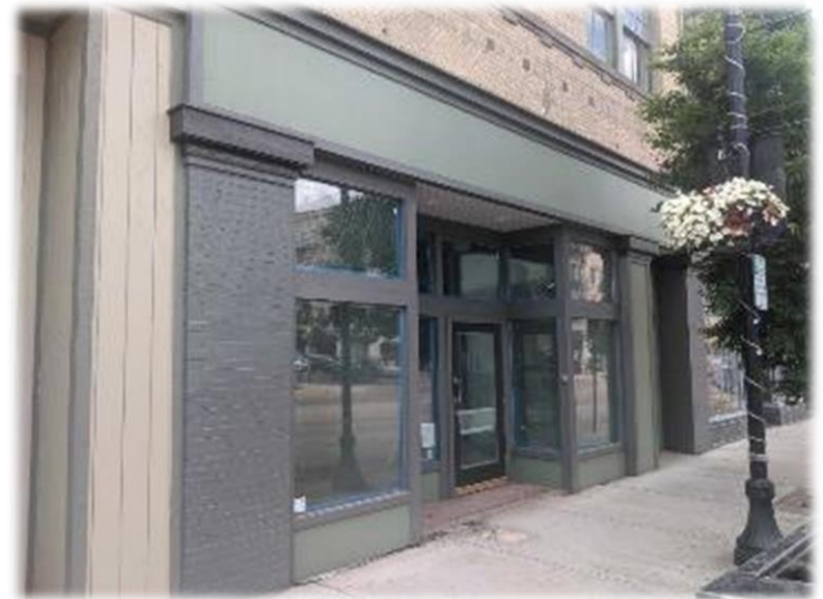
La Grande: housing, retail, facade