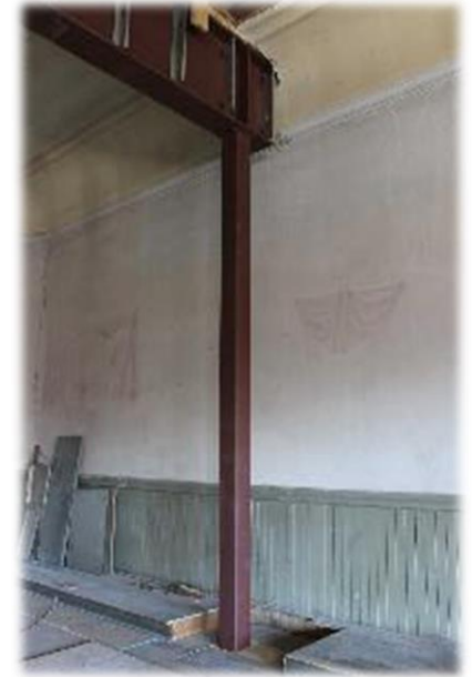
Baker City: structural