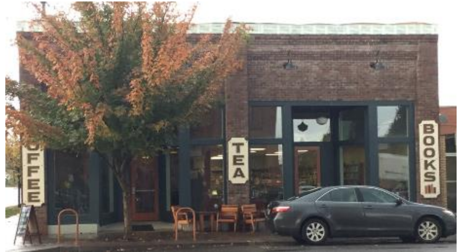
Newberg: facade restoration