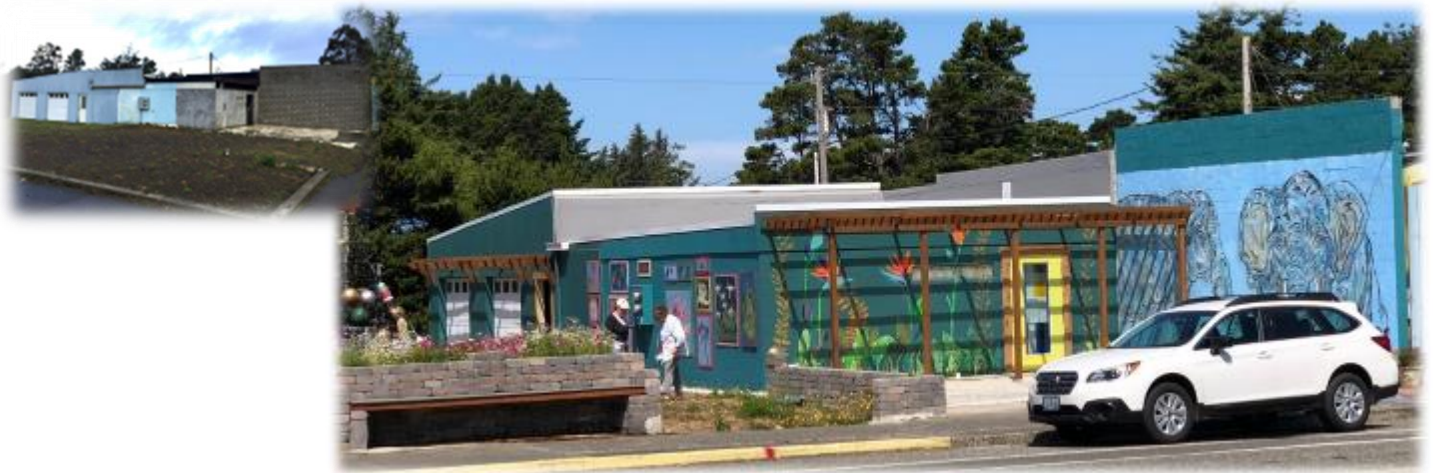
Port Orford: purchase and revitalize, 20 years vacant