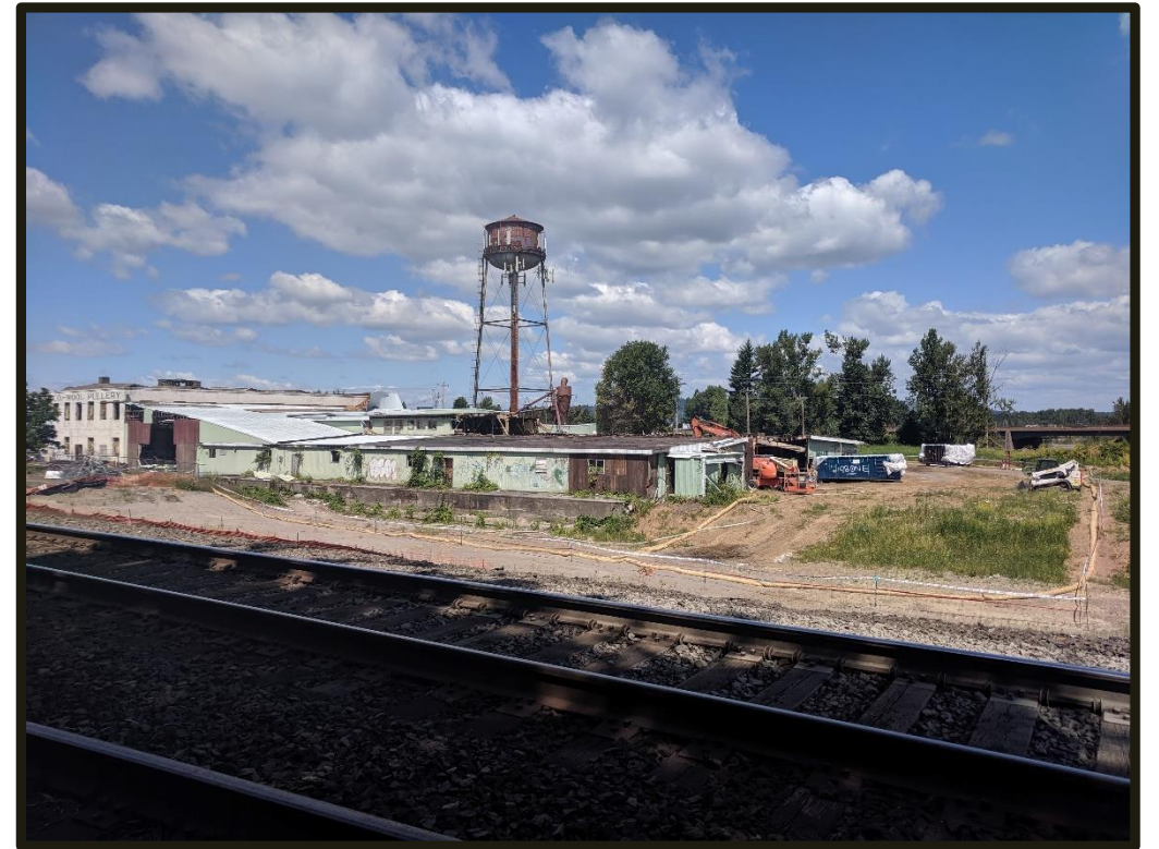
Troutdale Riverfront Redevelopment Site - 2019