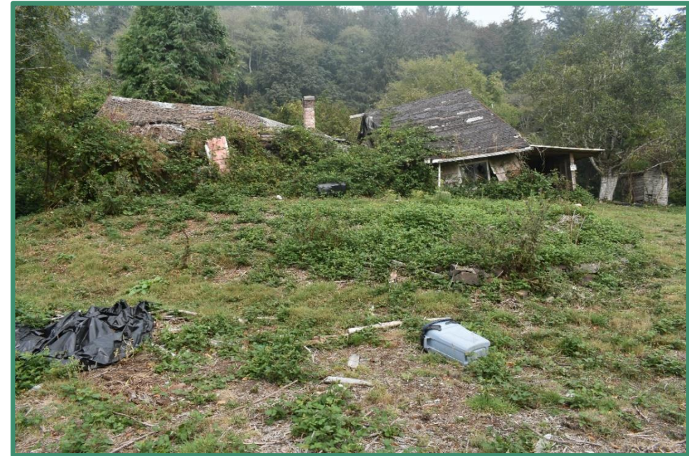
Sammy's Place, Tillamook County- 2020