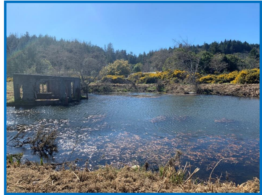
Bagley Creek restoration, near Port Orford - 2020

https://www.oregon.gov/deq/FilterDocs/2021AnnCUreport.pdf