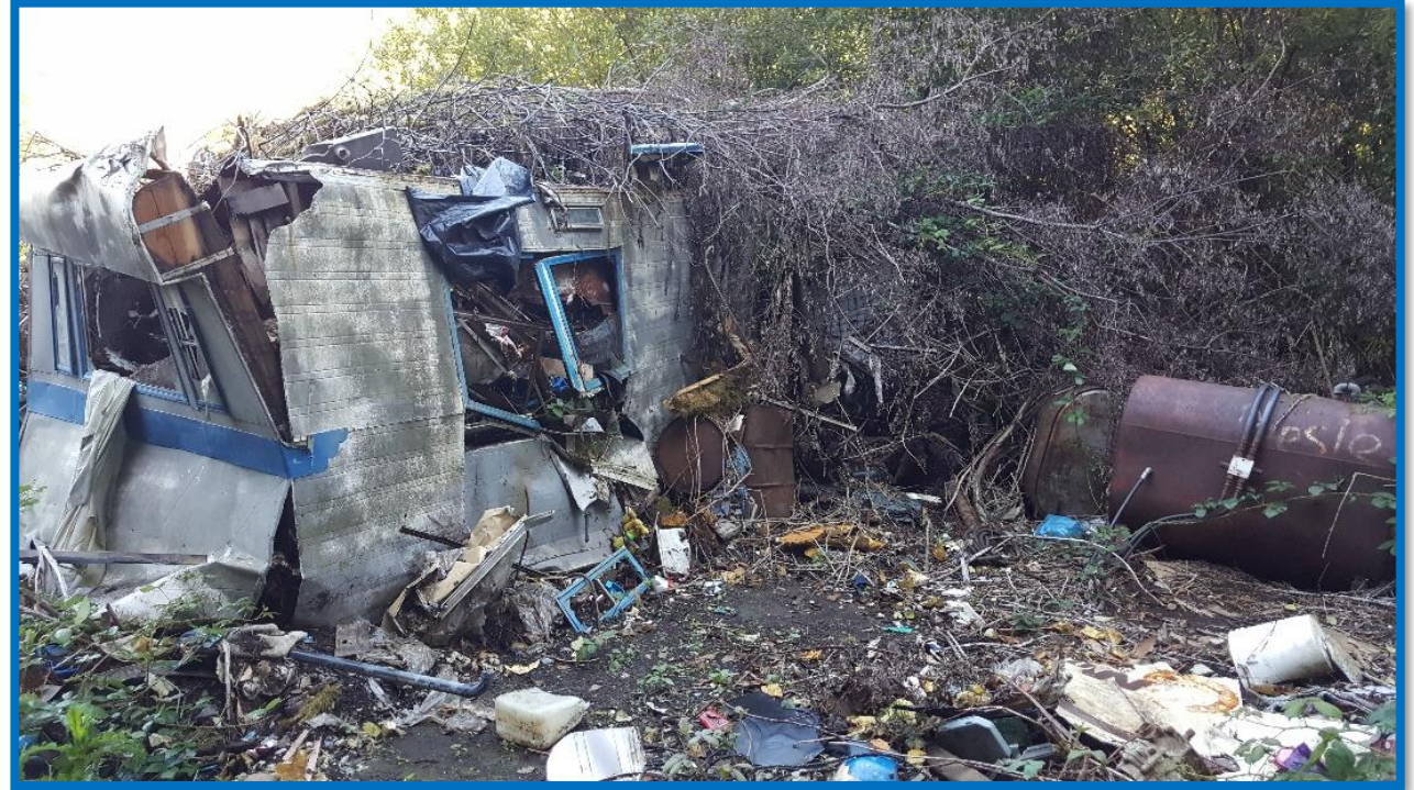
King Salvage, Lincoln County - 2020