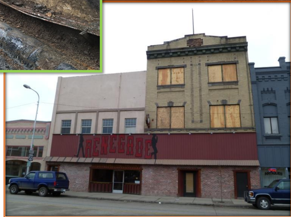
Staff Theater/Odd Fellows Building, La Grande