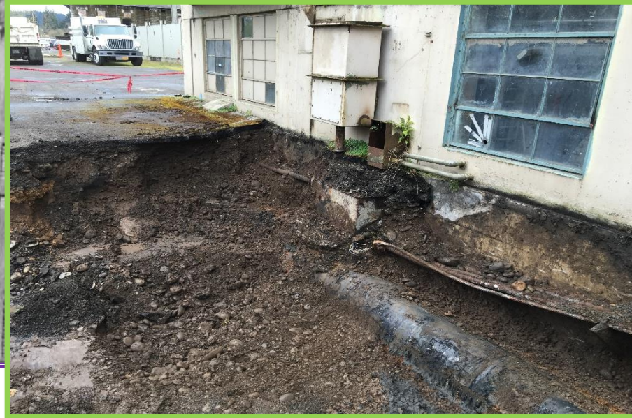
Eugene Water & Electric Board