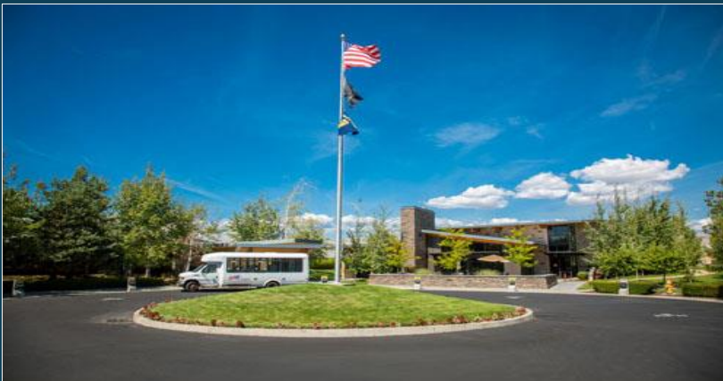
THE DALLES (1997)