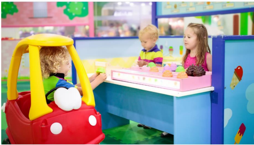
NeighborImpact, Deschutes Co., City of Bend grant $650K to child care providers