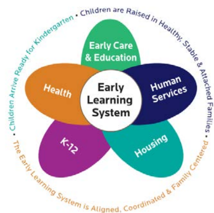
Figure 1. Early Learning System