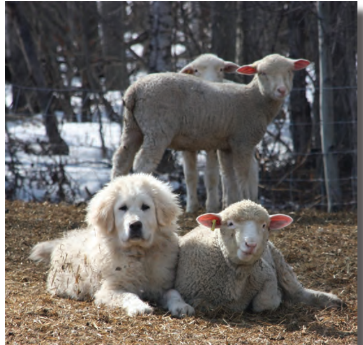
Guard dog puppy and lambs.

Livestock losses are an unfortunate reality of ranching and the use of traps and snares is a common way to attempt to reduce predator-livestock conflict. However, one USDA study (Shivik et al. 2003) noted that for many types of predators, there is a paradoxical relationship between the number of predators removed and the number of livestock killed. Surprisingly, these researchers found that as more predators were removed, more livestock were killed.