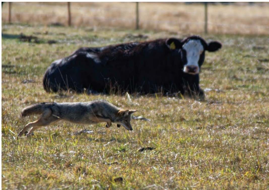
Coyote hunts rodents not cows.

Predation management researchers are not the only ones who have observed this relationship between