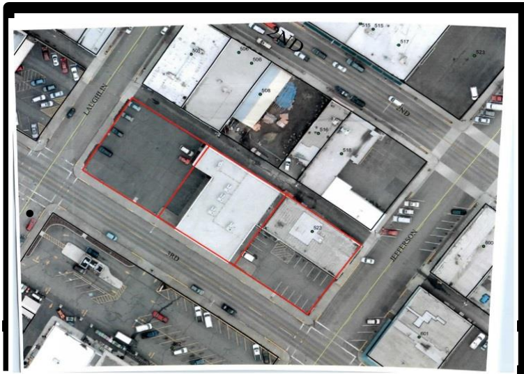
Celilo Flats – Project Site

Support from the state for this proposed development would provide benefits to the community as a whole. In addition to the expansion of retail outlets, the affordable apartments would provide critically needed quality housing for employees in the region as well as local retirees.