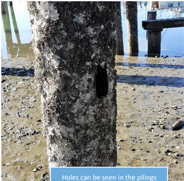
Holes can be seen in the pilings beneath Port Dock 5

The Port of Newport asks for your backing and advocacy as we seek grants for this vital project, and we hope that we can count on you for a letter of support that will help us secure funding.