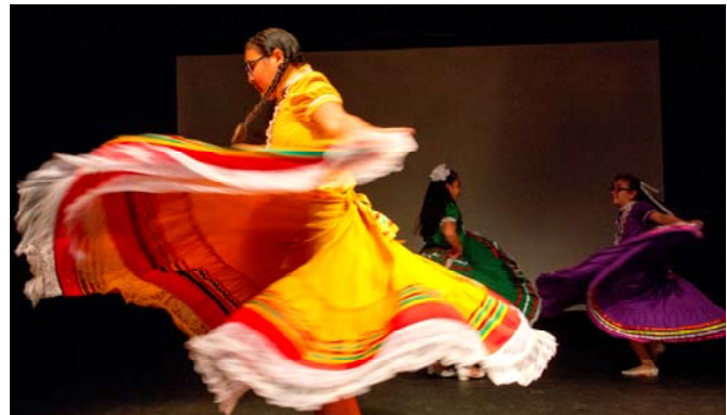
Un Dia De Teatro, Hood River.

The Trust has tremendous potential to continue to grow contributions and expand impacts. In 2015, the Cultural Tax Credit was claimed by just one percent of eligible filers (i.e., tax payers who filed itemized tax returns). Given the efficiency and reach of the Trust's programming and grants, the impacts it already achieves could be expanded by increasing awareness among eligible donors and increasing its available funds.