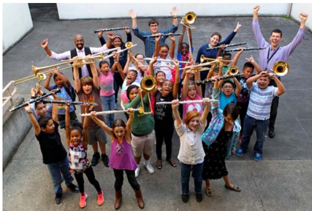
BRAVO Youth Orchestras wind ensemble.

The Trust serves as a nexus for the entire cultural community in Oregon, and can use this position to amplify the effects of its grantmaking activities. The Trust and its partners provide cultural networking opportunities and invest in capacity building for small and growing cultural nonprofits across the state.