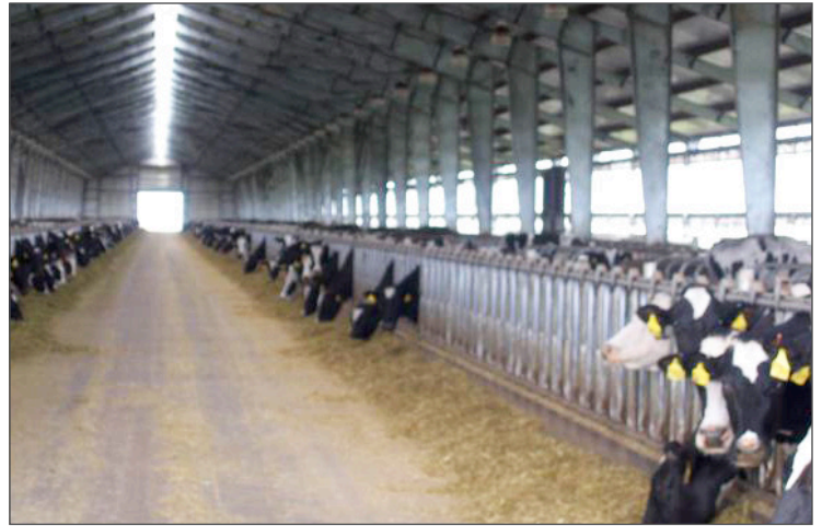
Dairy cattle are fed nutrient dense diets to increase milk production. The rich diets lead to an increase in the amount of gases emitted by each cow, which can contribute to global warming.

Large dairy CAFOs have the potential to threaten entire communities. One 1,500-cow dairy in Minnesota re-