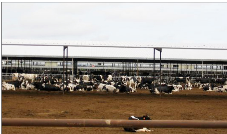
Gestating milk cows loaf on dirt lots before being moved into the dairy operation for milking once they have had their calves. Cows in these operations do not have the opportunity to graze on pasture.

the United States, and manure management is the fastest growing major source of methane, increasing by more than 50 percent between 1990 and 2008. 34