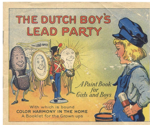
and exposed children to lead paint.

The first step is to recognize the problem. Now that we know better, we must label wireless digital devices that can harm us. It's time.