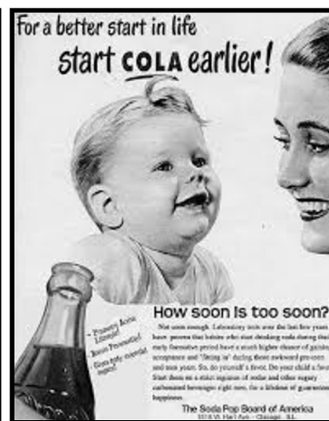
fed sugar-laden colas to babies,