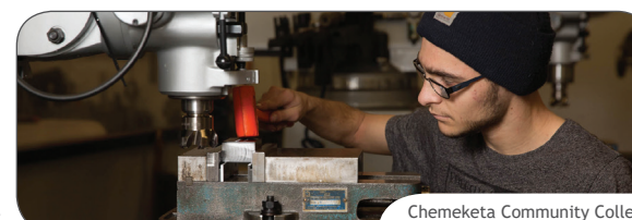
Chemeketa Community College