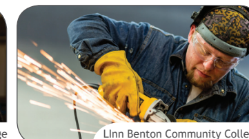
Linn Benton Community College