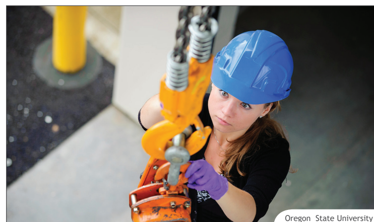
Oregon State University