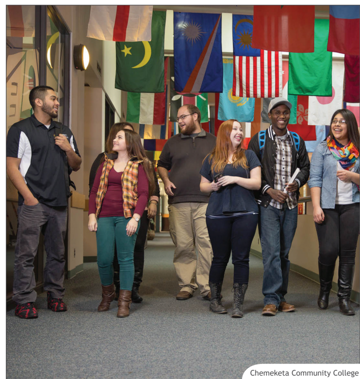
Chemeketa Community College