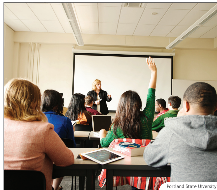
Portland State University