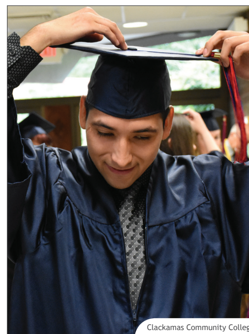
Clackamas Community College