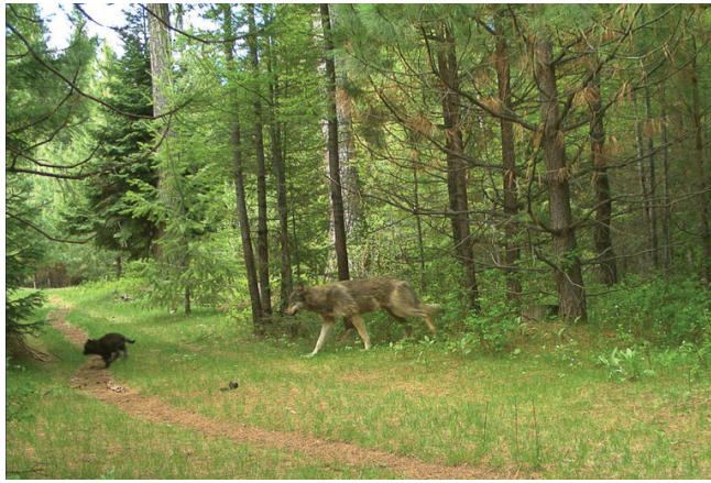
One subadult and one pup from the Catherine Pack on private property in eastern Union County, May 2017.