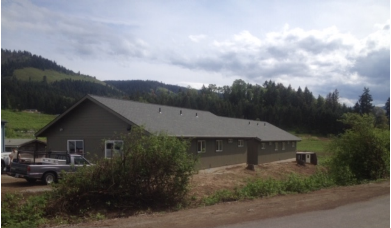
2016 New Construction: After Exterior Photo Houses both year-round and seasonal employees