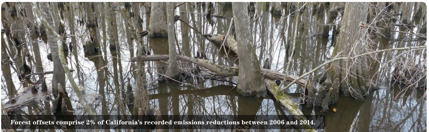
Forest offsets comprise 2% of California's recorded emissions reductions between 2006 and 2014.

We conducted research on all 39 forest offset projects that have been credited by the state. We answered two questions: 1) Are forest offsets providing real climate benefits? 2) Are forest offsets providing other benefits, such as supporting habitat for rare species or opportunities for recreation?