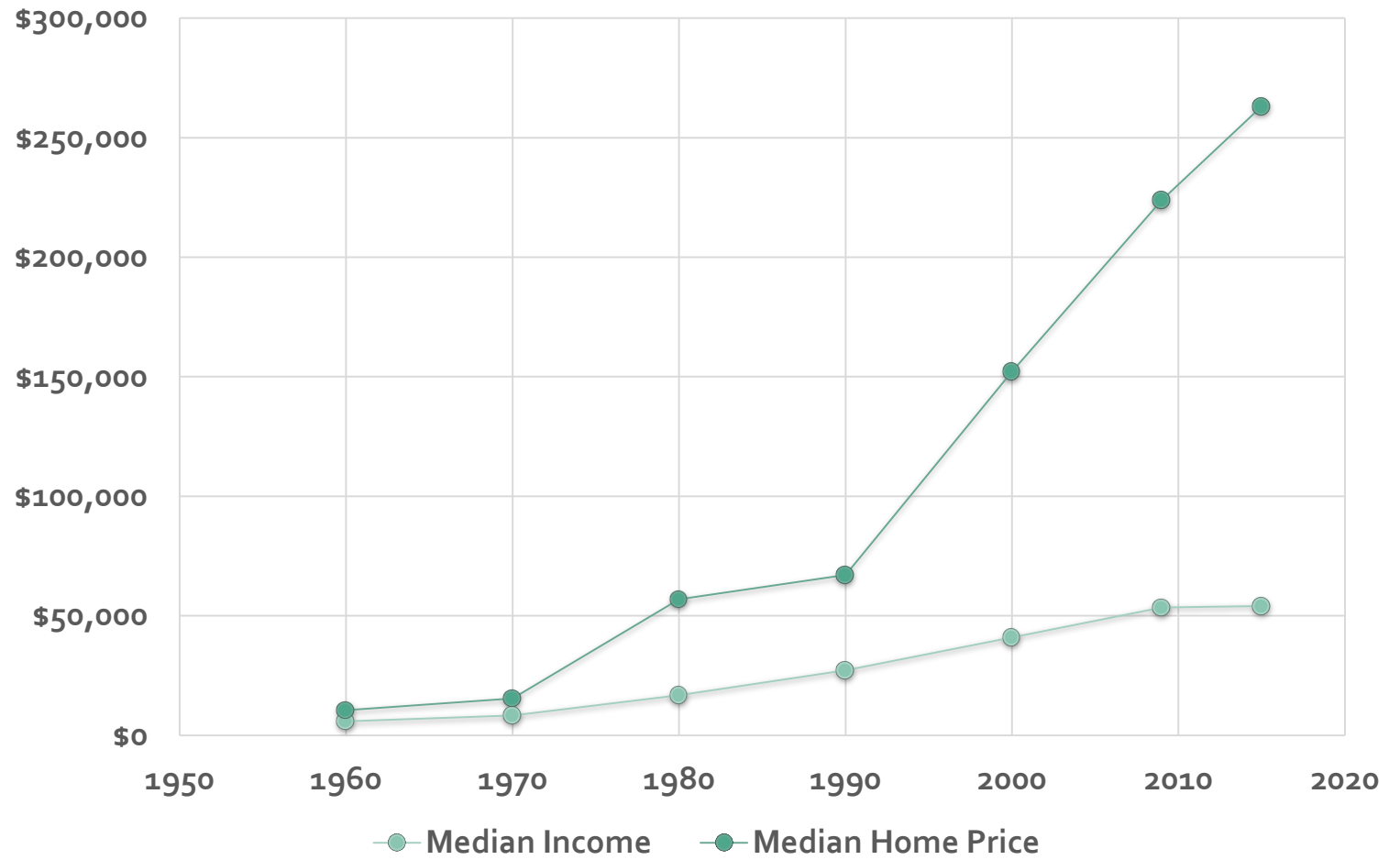
Historical Oregon Homeownership Affordability