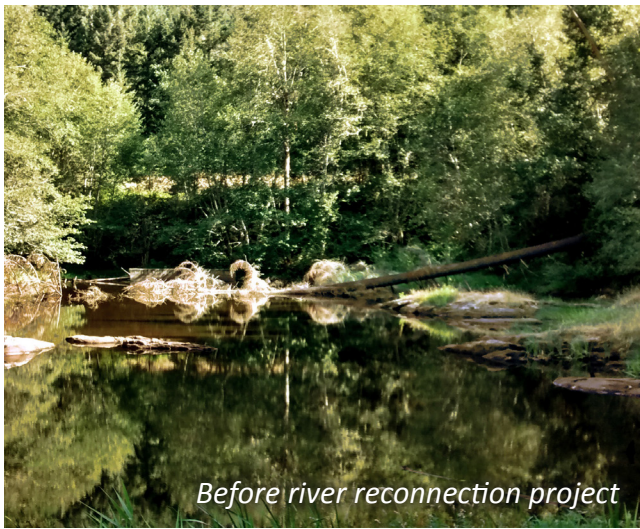
Before river reconnection project

OWEB has funded more than 9,200 grants since 1999, with which Oregonians have restored more than 5,400 miles of streams and have made more than 6,400 miles of habitat accessible for fish. The grants have helped landowners improve more than 1,198,000 upland habitat acres and restore, improve, or create more than 54,000 wetland or estuarine habitat acres.