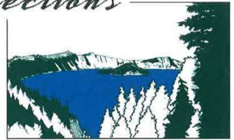
Crater Lake National Park located in Klamath County