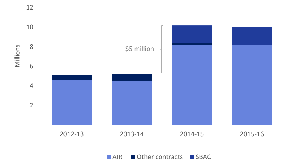
Figure 1: Contract payments to support most statewide tests

distributing Kindergarten Assessment materials and supporting an OAKS retest opportunity offered to 12<sup>th</sup> graders during the transition year.