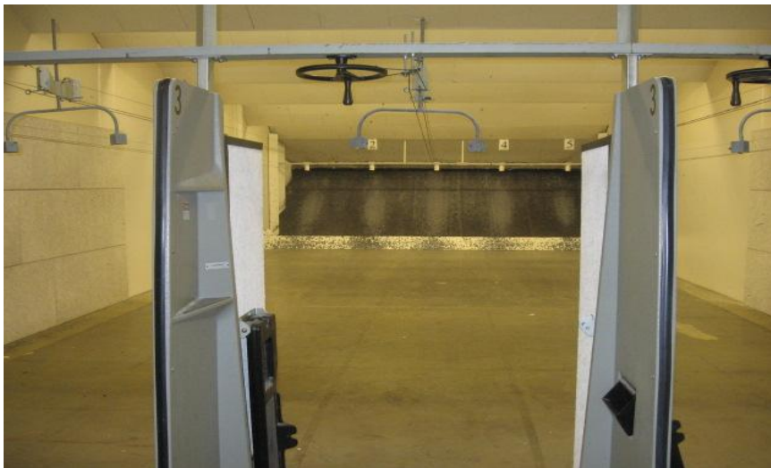
Kliever Armory IFR