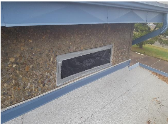
Sealed IFR Vent