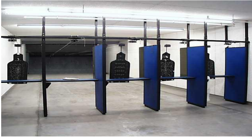
Baker City IFR