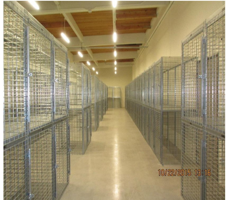
Former Roseburg IFR After Abatement & Conversion