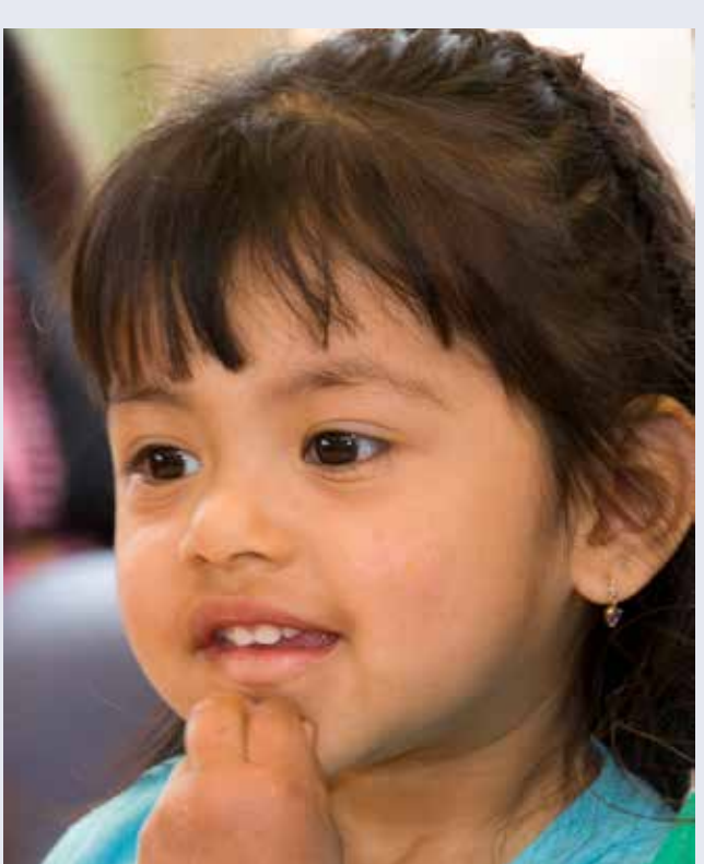
Children of Latino migrant workers in Hood River County, Burmese refugees in Portland and Somali immigrants in Beaverton are benefiting as their parents take parenting series offered in their first languages.

NAYA has used its three-year Small Grant to repeatedly (continued, next page)