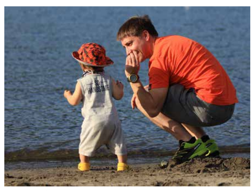
One-day workshops or family activities, such as a Saturday picnic, help build relationships with parents and warm them to the idea of taking a full course.

One of those classes unfolds one sunny May morning at Lane Community College in Eugene, where Shae Donnelly leads three teen-age