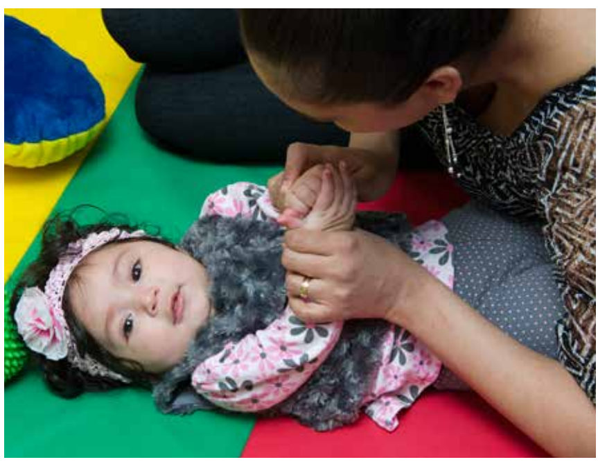
Parents who completed the training said "they had an increased understanding of age-appropriate behavior, were better able to manage stress, communicate more effectively and had more patience," OSU researchers reported.

Ongoing assessment by Oregon State University indicates that Hubs are leveraging additional resources to help support their work and had plans for sustaining the initiative when foundation support ebbs.