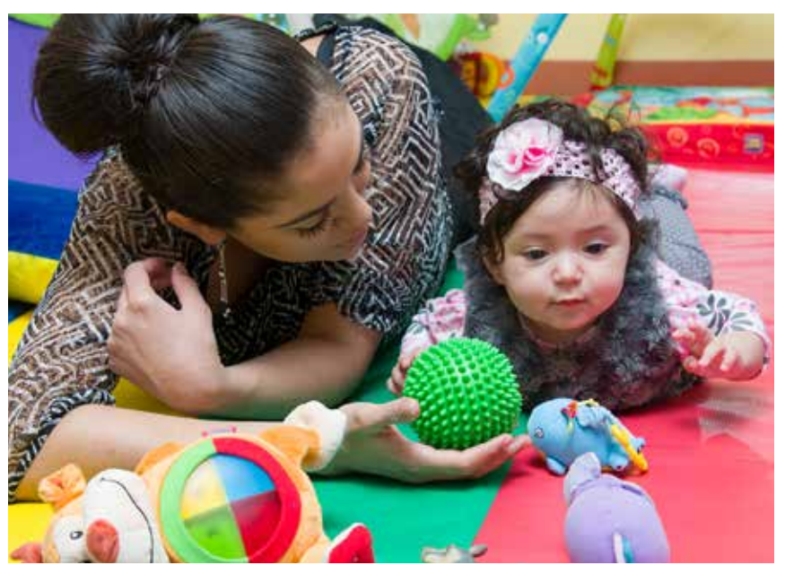
What if we acknowledged parents as our most precious national resource?

As of this printing, foundation funders have invested $8.25 million: communities have added an additional $12.3 million to the effort. With that investment, we have reached thousands of parents with young children through high-touch services like multi-week parenting classes and home visiting. And we've reached tens of thousands through lower-touch offerings such as one-time workshops and family-fun events. Even with these impressive numbers, we know we have a ways to go to make parenting education a community norm that is universally available and accessible.