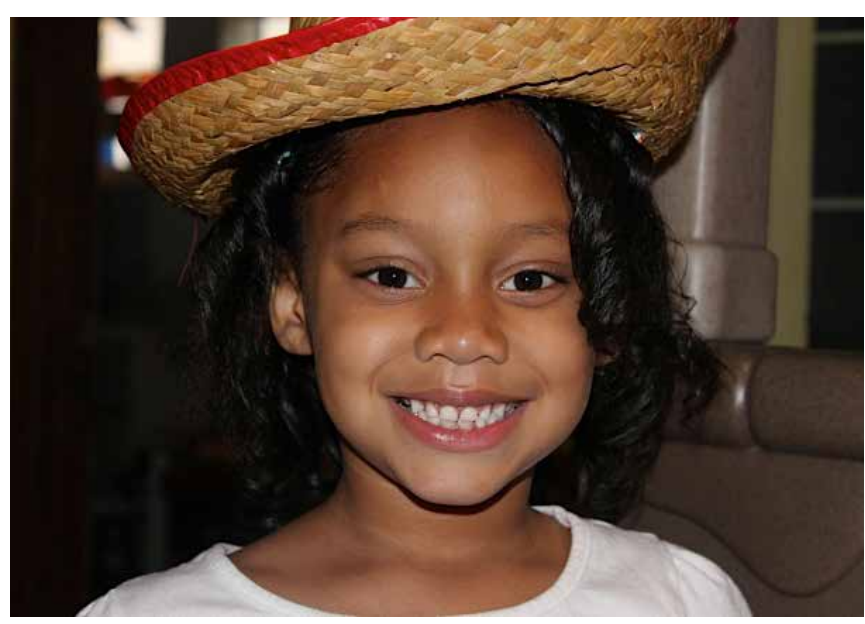
Research shows that parenting education has been linked to multiple benefits for children, including drops in child abuse and neglect rates, better physical and cognitive and emotional development in children, and reduced youth substance abuse.

After the demonstration, parents guide their children as they thread noodles. Honl and Angelina Salis-