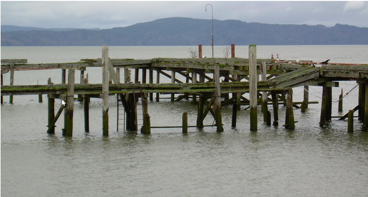
Abandoned piling, Columbia River