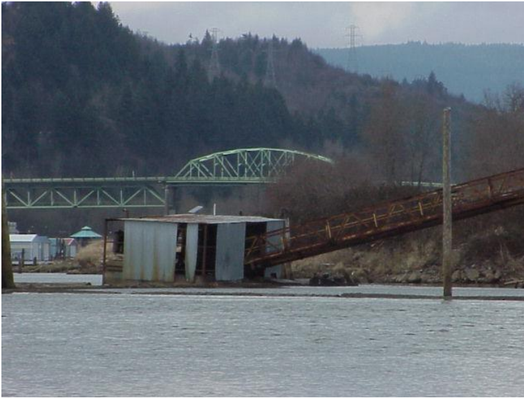
Abandoned piling field adjacent to Hayden Island