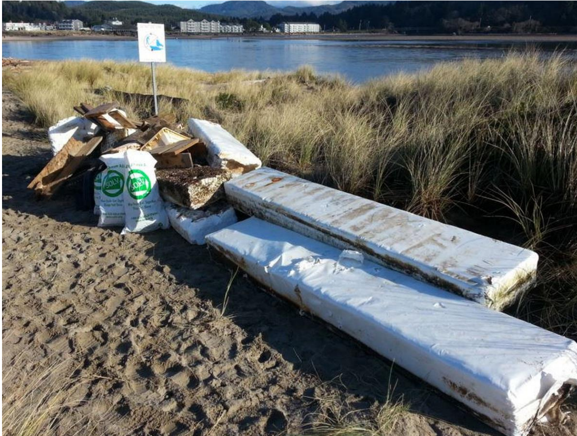
Abandoned docks from Coos Bay that washed ashore at Lighthouse Beach