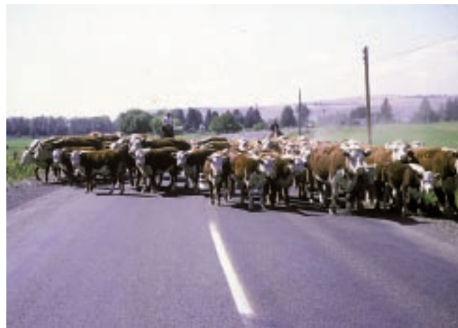
Farm activities often conflict with non-farming neighbors' expectations of a rural residential life.

For the rest of land in farm zones, LCDC gave counties three other tests: a lower income test, a parcel size test and a production capability test. Counties can use all three tests. There are also opportunities for non-farm dwellings. 6