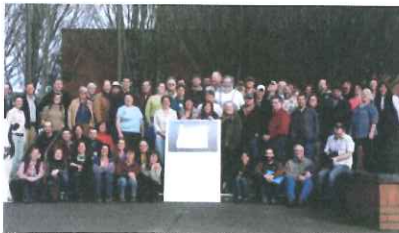
Friends of Family Farmers

Finally, the Friends of Family Farmers Staff, Board, and Volunteer crew contributed greatly to the Agricultural Reclamation Act. Their energy and dedication to this work is endless and an inspiration to all.