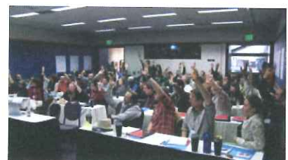
The Agricultural Reclamation Act