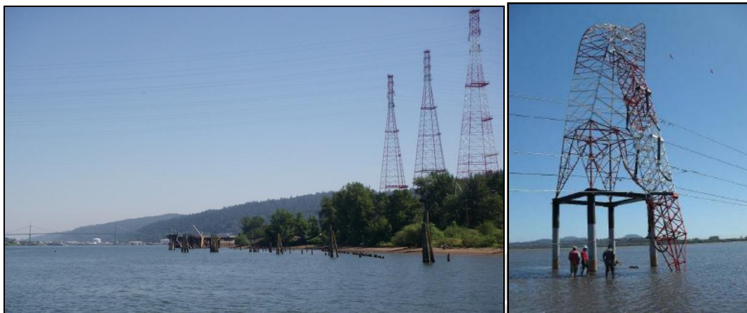
Left: These high voltage electrical transmission towers are built on a river bank in the Critical Energy Infrastructure (CEI) Hub susceptible to lateral spreading. Right: Structural damage to a high voltage transmission tower located at a river crossing in 2010 Chile earthquake

The Water and Wastewater Task Group (Chapter Eight) reviewed vulnerabilities of the pipelines, treatment plants, and pump stations that make up Oregon’s water and wastewater systems, and discussed the interventions needed to increase the resilience of under-engineered and antiquated infrastructure at potential failure points. The group proposed a phased approach to restoration of water services after a Cascadia earthquake and tsunami, beginning with a backbone water and wastewater system capable of supplying critical community needs.