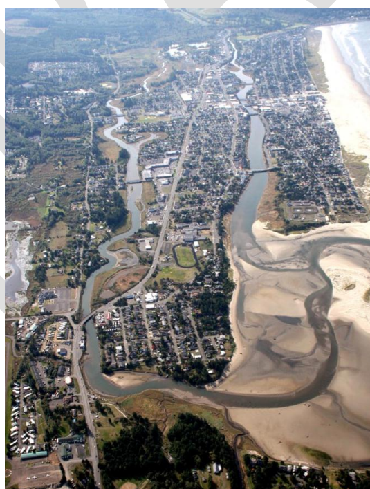
Tsunami Vulnerability: City of Seaside with 83% of its population, 89% of its employees and almost 100% its critical facilities in the tsunami inundation zone.