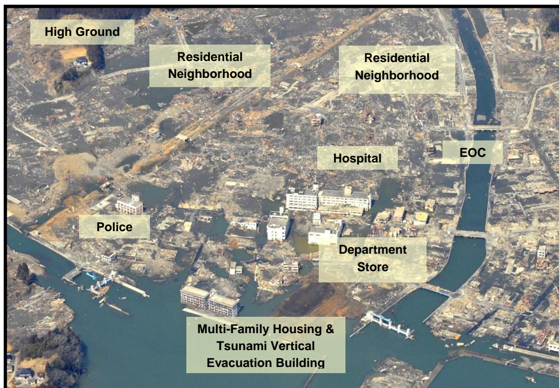
Critical Facilities in the Tsunami Zone – Minamisanriku, March 14, 2011. Because their hospital, emergency operation center, and other government and community service facilities were located in the tsunami inundation zone, the surviving community lost nearly all of its capacity to respond and implement recovery efforts.